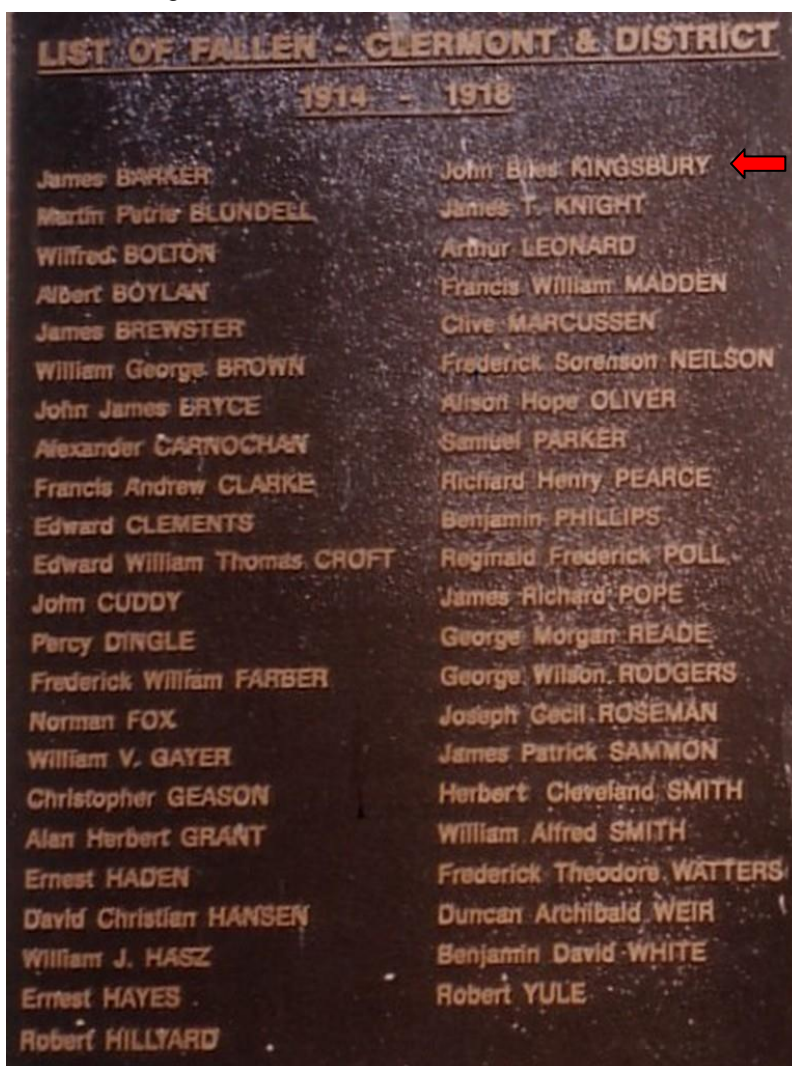
List of Fallen Clermont & District 1914 – 1918