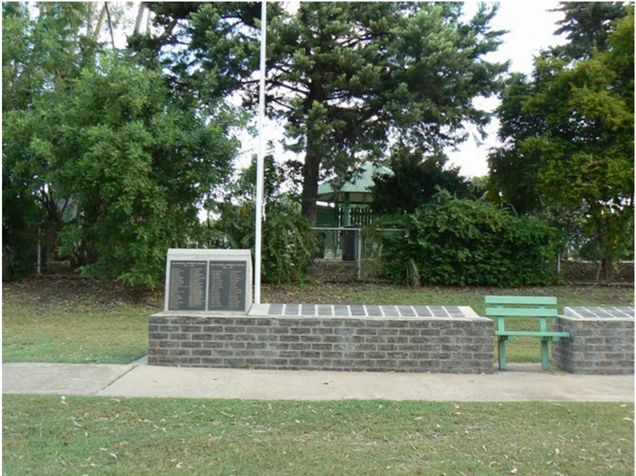
Remembrance Way